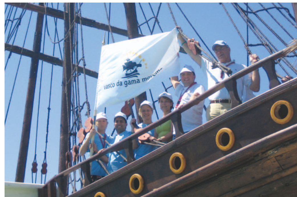
2005, Kos - the VdGM in during the 11th WONCA Europe Conference

The influence of VdGM also became more relevant because of several sessions the group presented, reflecting the work of the pre-conference. In the homeland of Hippocrates, VdGM celebrated its first anniversary with awareness of its responsibility for future steps.