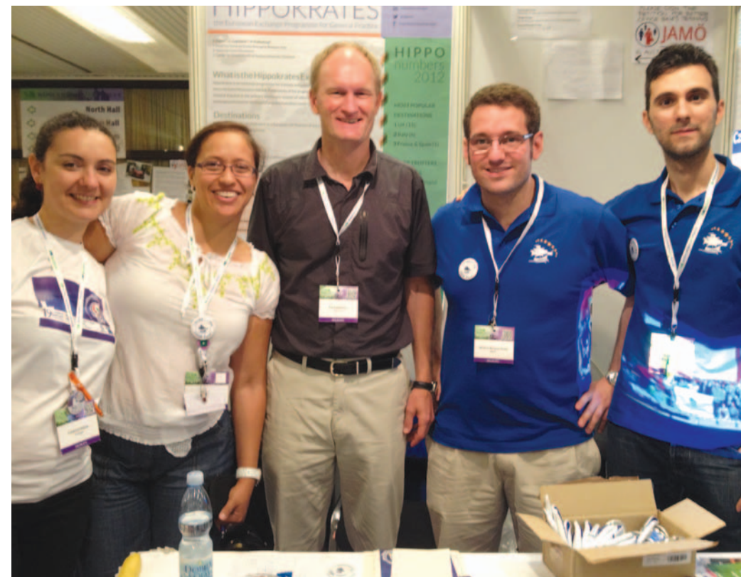
June 2013 – WONCA World, Prague

We must not close ourselves into our little cocoon, no we will degenerate into a closed mind of pitiful self-centeredness whining in self-defense – can you hear those tones among yourselves and colleagues? “We are not getting the respect we deserve”, “Family