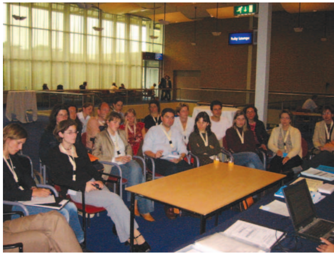
June 2004, Amsterdam - first general assembly

strong will was driven motivating all the participating countries to create a new network. A first general assembly was organized, and a declaration of intent was approved to create a network under the umbrella of WONCA Europe. The meeting was held in a hall of the Congress Centre on the 2nd June, and in the next few days WONCA Europe accepted the intention.