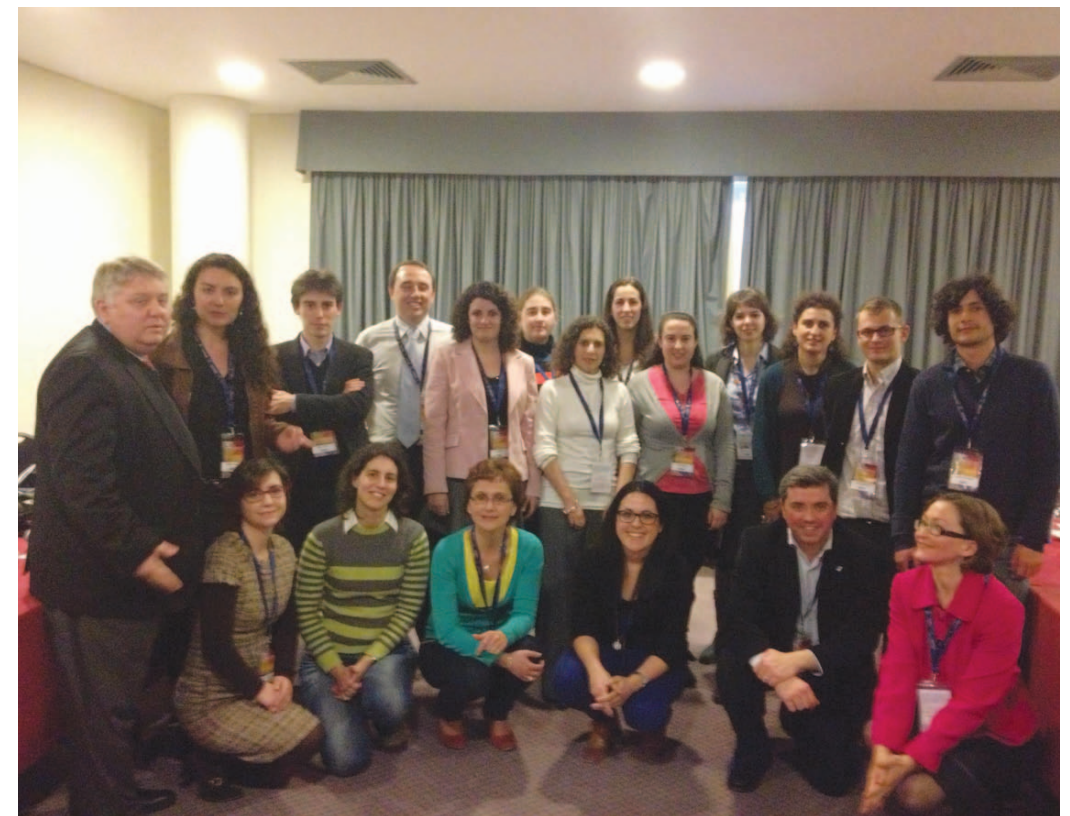
Feb 2013 - Mini Hippokrates at Aveiro